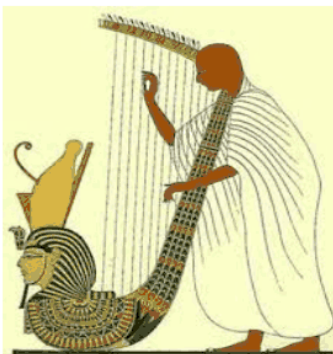
The Avatar / The Harp

“ The Avatar, the Messenger must be the harp whose notes vibrate in all the spheres...the harp, the chord, the word , having felt with all ; is the seed and Ra of the universe ”. Reference: “ Light of Egypt ” Volume 1, page 185. (The Octave is the Most Perfect of the chords — ‘As above So below’).