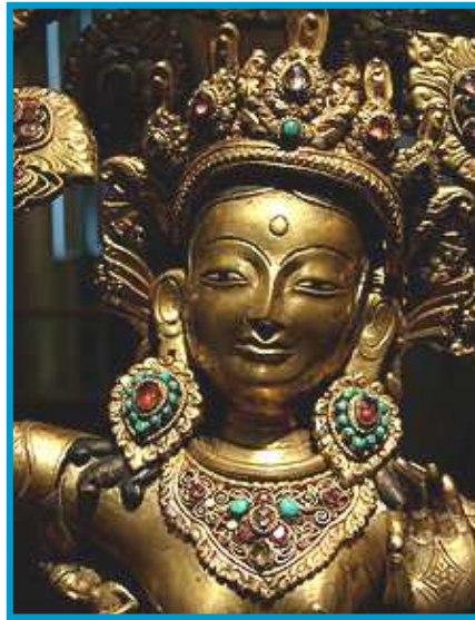
Image of Queen Maya, Mother of Siddhārtha Gautama, Shakyamuni or simply Buddha.