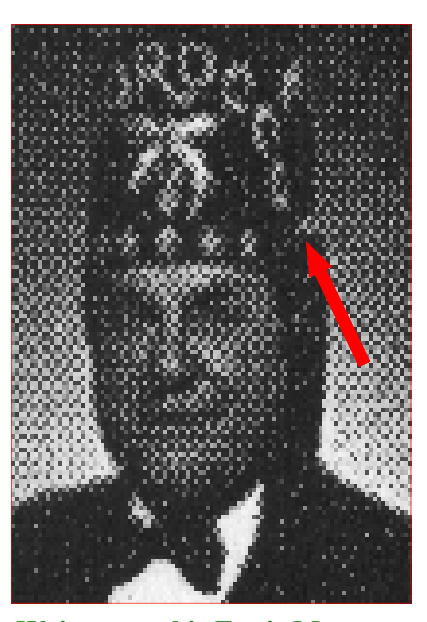
Written on this Fez is Morocco