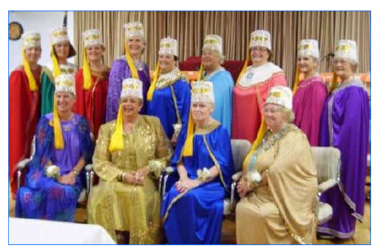
Members of The Daughters Of The American Revolution —The D.A.R.

If you do not plan (plant) to bring any more royal crowns here, please teach your daughters, who are the direct descendants of the founders of Civilization. Teach them Ancient High Science, Culture, Gnosticism, Cosmology, Alchemy, Geometry, Algebra, Numerology, Astrology, Architecture, Mathematics, Philosophies, and the science of the Womb, as everyone else is drawing wealth and knowledge from it and wearing it (the symbol of the womb) atop their head as their royal crown, except for the Mother of Civilization herself. —YOU! The Moabite / Moorish / Asiatic / African Woman.