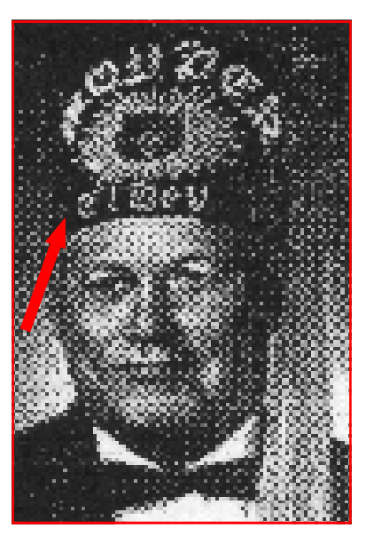
Written on this Fez is El Bey