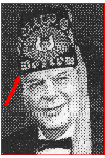
Written on this Fez is Moslem