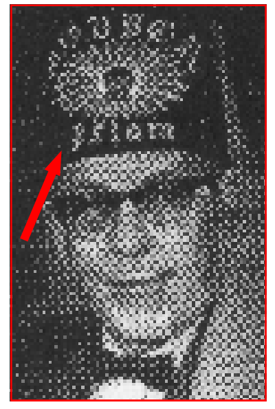
Written on this Fez is Islam